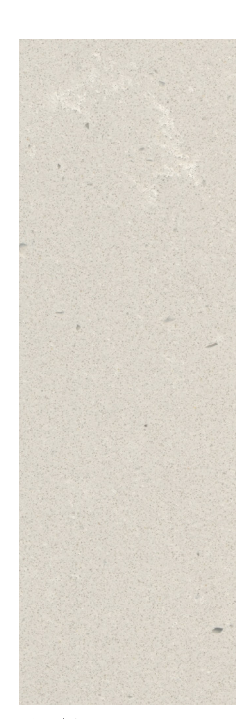
4001 Fresh Concrete

Includes marks such as: knives and metal pots