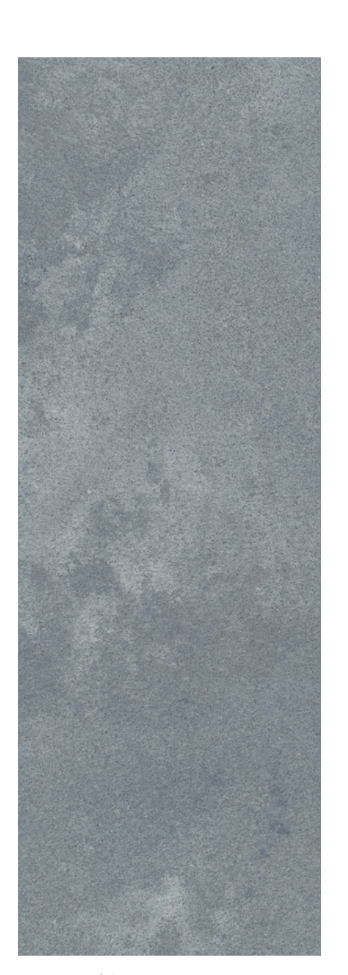
4033 Rugged Concrete

Includes stains such as: food coloring, herbs and spices, red wine, mustard, coffee/tea, fruits