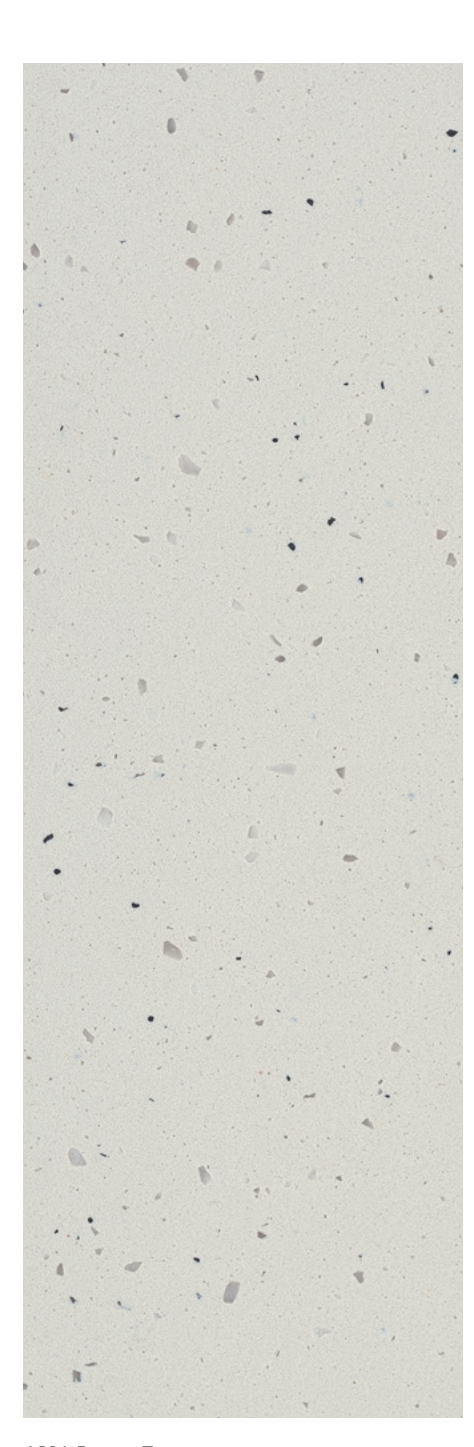
4601 Frozen Terra

Includes stains such as: olive oil, canola oil, machine oils