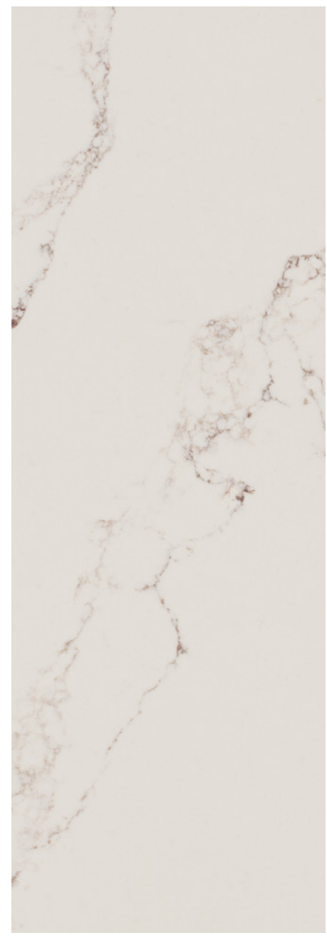
5111 Statuario Nuvo

Soft Scrub * Liquid Gel should remove most dirt and spills. For tougher spills or dried-on stains, apply alcohol to a cloth and let sit for a few minutes. Wipe clean with a damp cloth or paper towel then dry the surface. To remove hard water deposits, treat the surface with a 50/50 combination of vinegar and water before wiping.