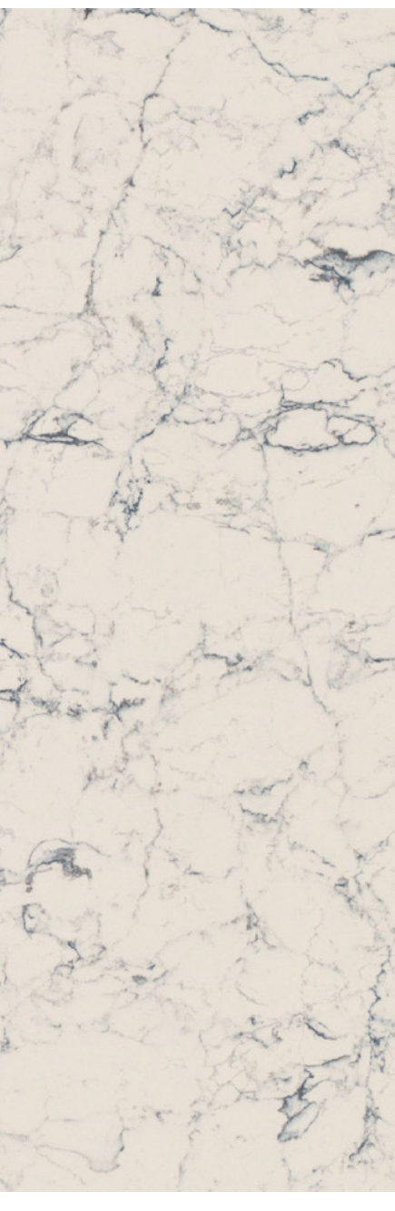
5143 White Attica

Those wishing to use environmentally safe cleaners may also use a combination of 50/50 vinegar and water, rinsing and drying the surface thoroughly afterwards.